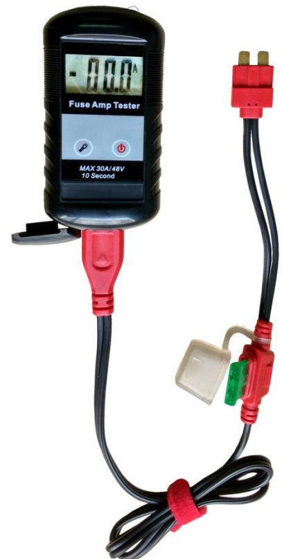
Fuse Amps Tester (30A)